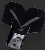
Snow DEFENDER® 4500