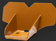
Snow DEFENDER® 1500