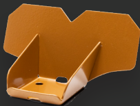
SNOW DEFENDER® 1500