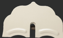
SNOW DEFENDER® 6500