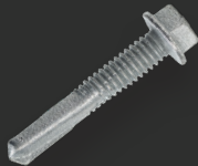
Metalgrip™ #5 W/O WASHER