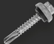
ProZ SD #3