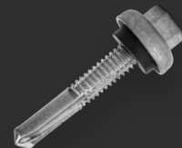
ProZ SD #5