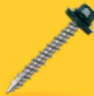
Fastgrip #10 Hi-Lo