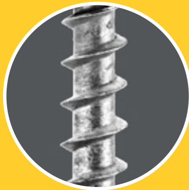
#12 Deep Thread Shank