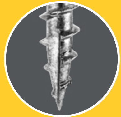
Type 17 Point