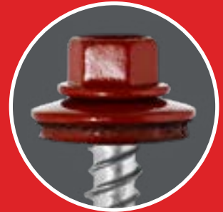
Bonded EPDM Washer